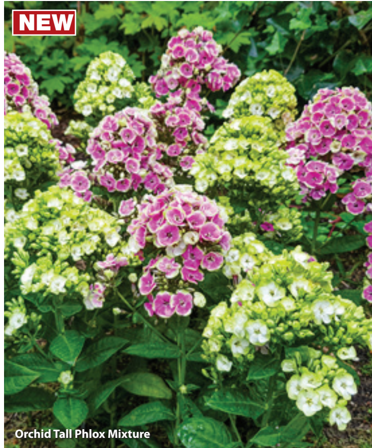
Orchid Tail Phlox Mixture